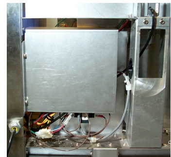
Figure 3: The shield is installed using the two screws in the cabinet wall. Ensure the leading edge of the shield slips over the top of the component board and no wires are pinched by the edges of the box. Most wires should emerge from the bottom of the shield